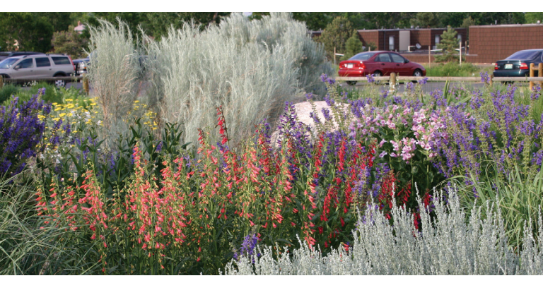
Kendrick Lake Gardens, Lakewood, Colorado, photo by Plant Select®

For more information, email horticulture@botanicgardens.org