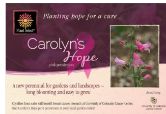
Carolyn's Hope Postcard