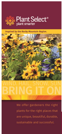
Rack Card (About us)